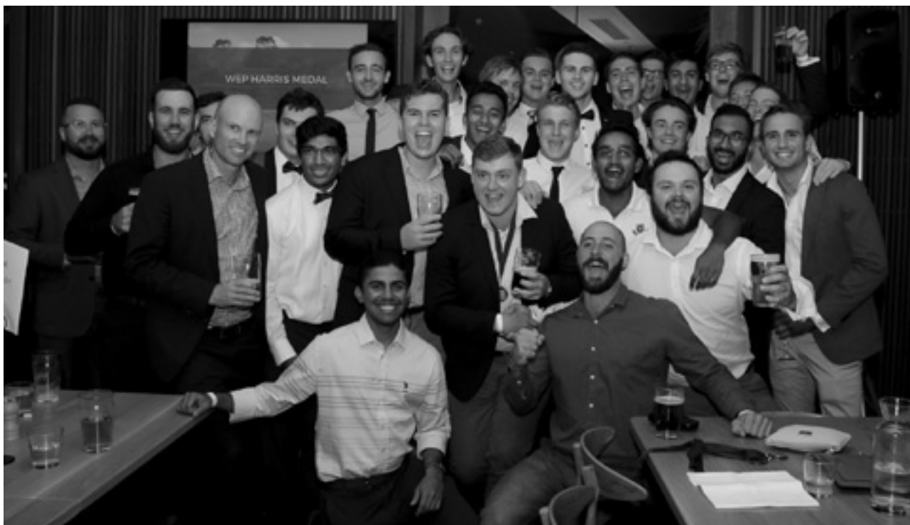
This masterpiece is of the Uni 4s and 5s – sums up our season nicely.