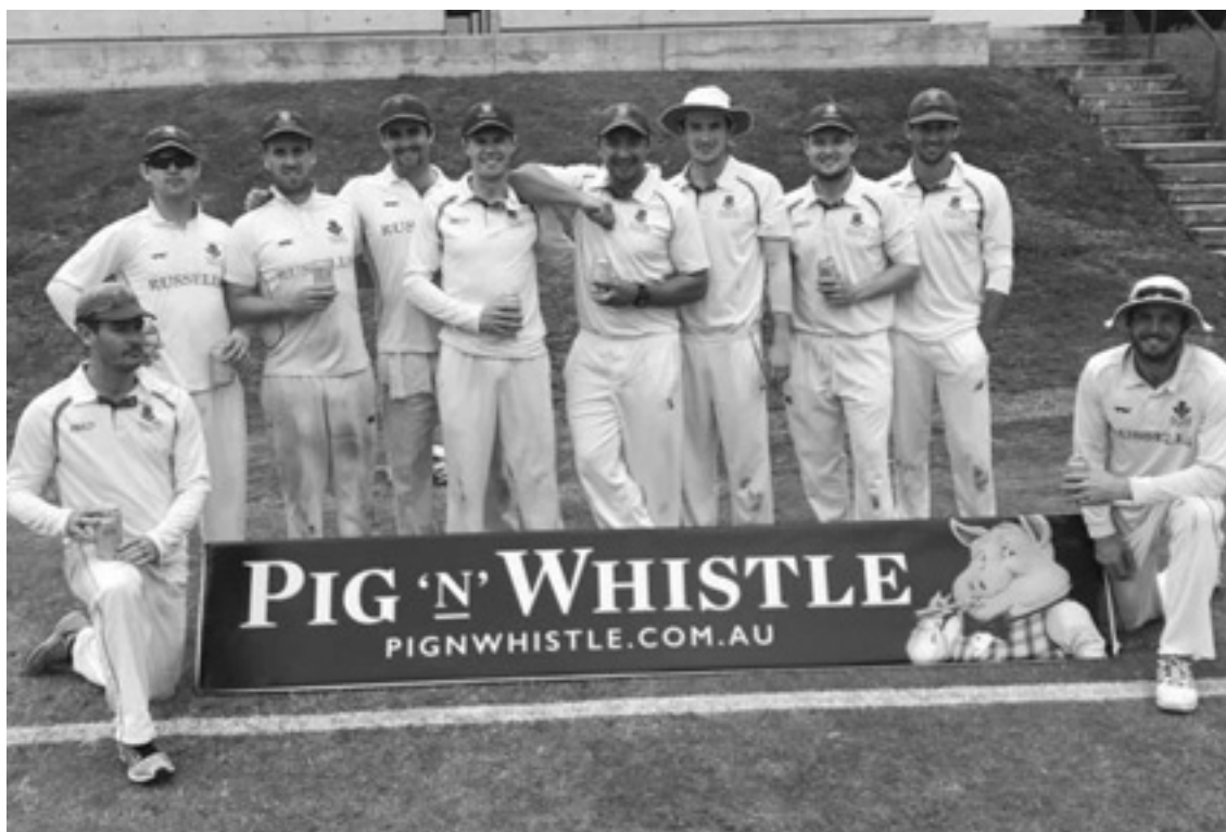
First Grade celebrating a win during 2017–18